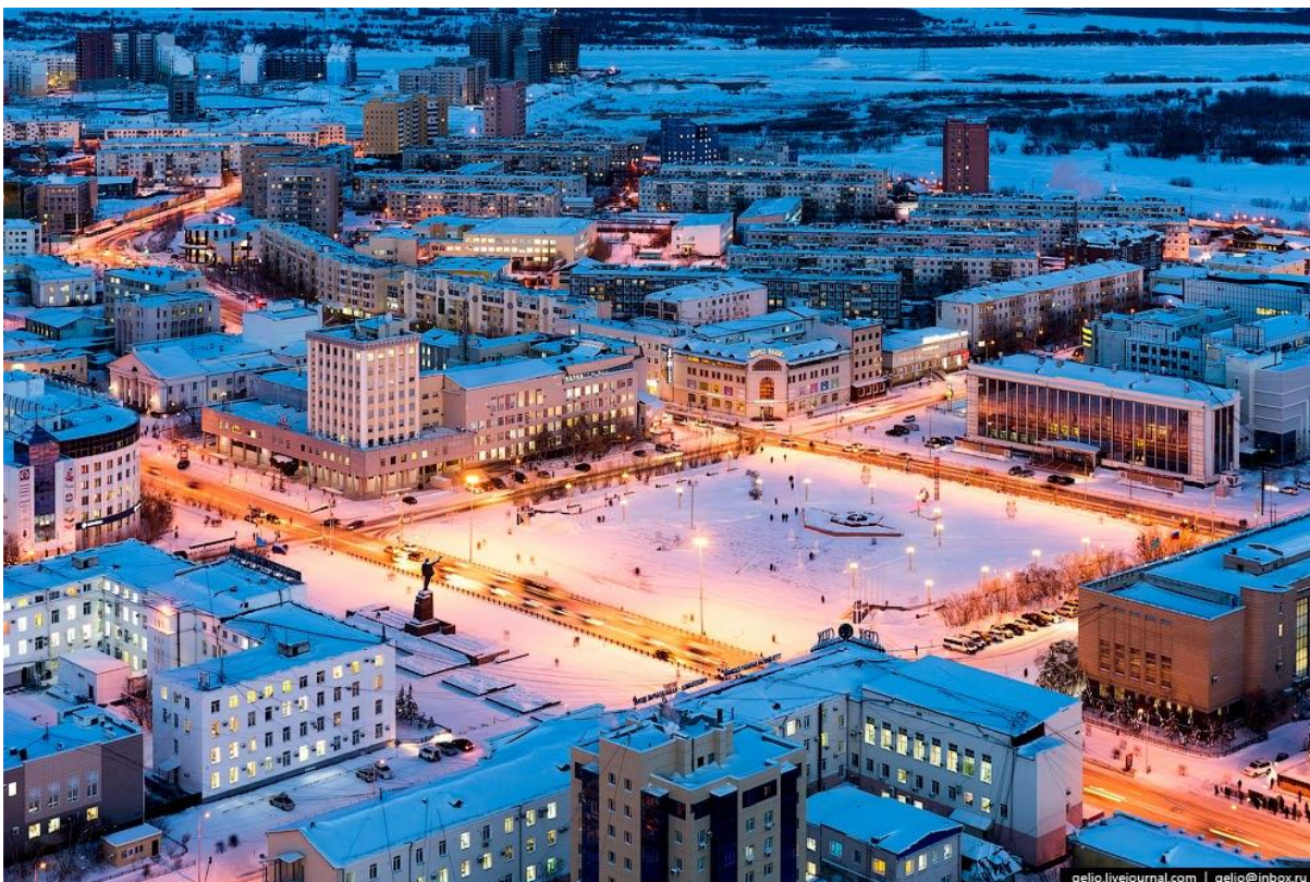
Fig. 4 The city of Yakutsk covered in permafrost