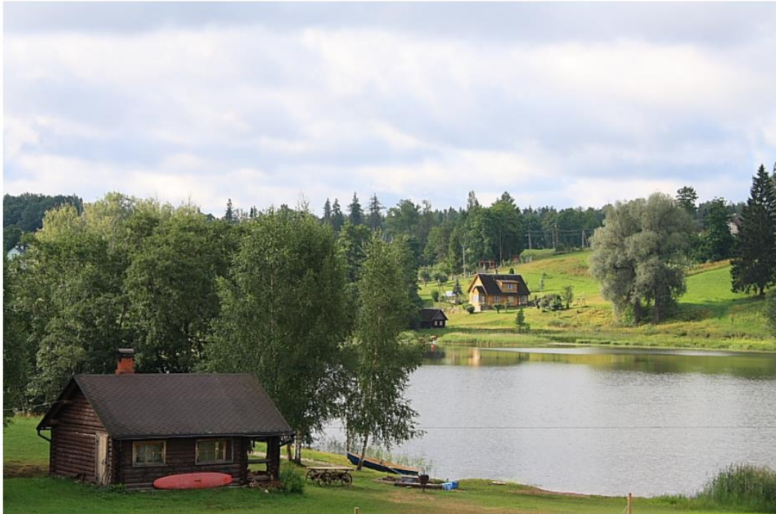
Countryside near Rõuge in Võru County, south-eastern Estonia