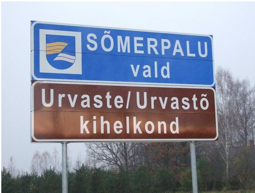
A bilingual sign in Estonian and Võro. The town of Urvaste in Võro County is Urvastõ in Võro