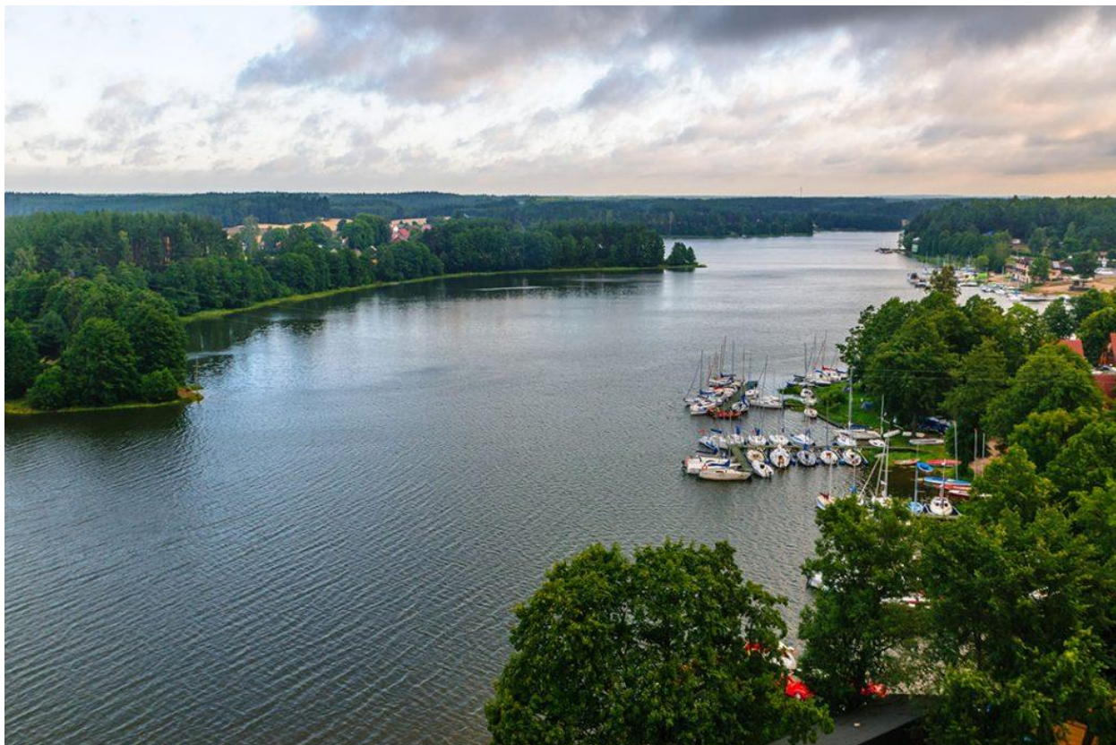
Aerial view of the Wdzydze lake in Wdzydze Kiszewskie, Kashubia region, Poland