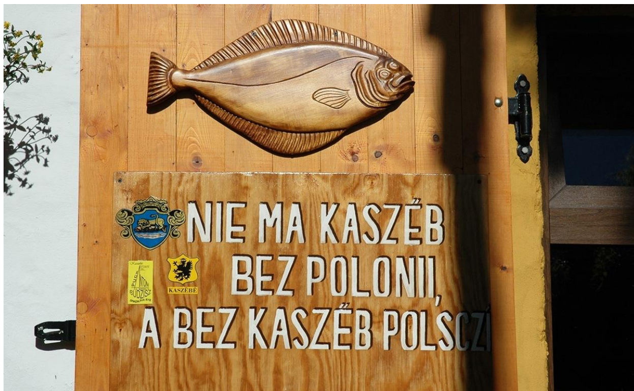
Kashubian writing in a restaurant on the bay in Puck, Kashubia